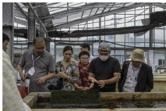
Img. 2 Sea Grape Farm Tour