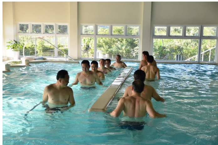
Img 4: Participants Experience Thalassotherapy at DOW Research Center in Taitung