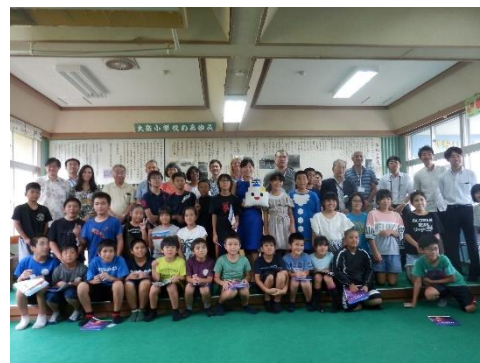
Img. 4 Presentation at Ootake Elementary