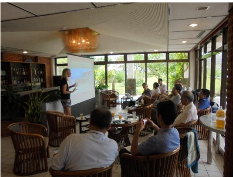
Img. 3 Mini Workshop

In 2019, the 10 th Okinawa Hawaii Ocean Energy and Economic Development Symposium and Workshop will be held on November 8 th -9 th in Kona, Hawaii. We hope you will be able to participate.