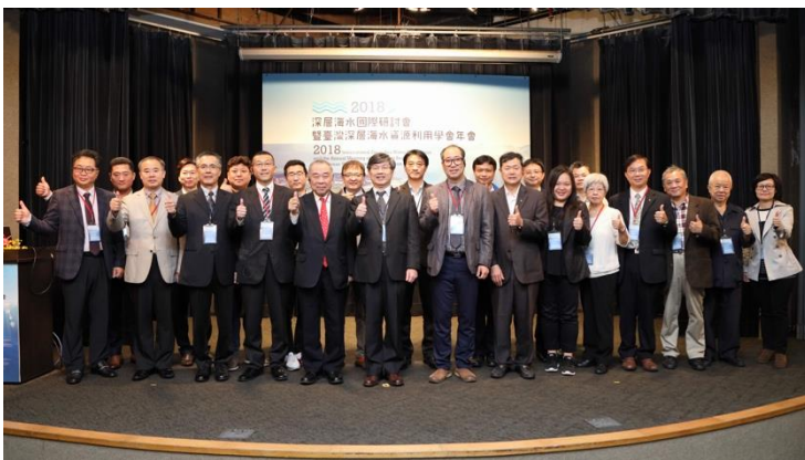
Img 1: Commemorative Photo with Guests to Taipei

Afterward, we travelled to the DOW Center and visited facilities such as DOW desalination/mineral extraction, caterpillar fungus cultivation facility, an experienced bathing at the thalassotherapy facility.