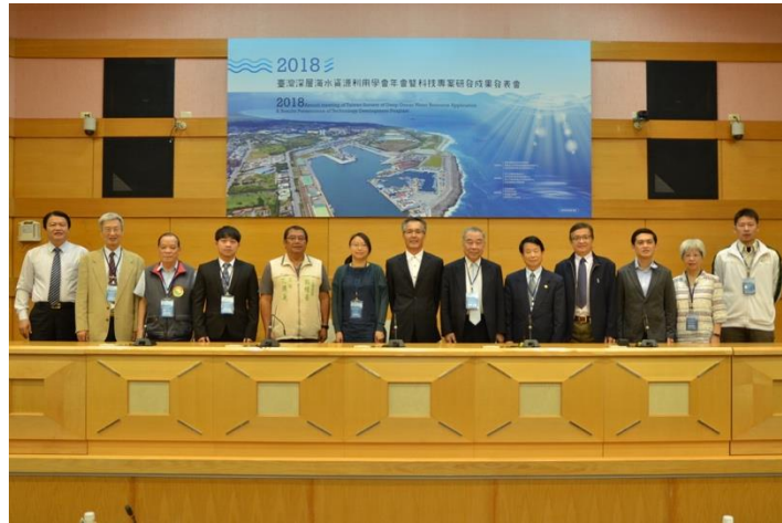
Img 3: Commemorative Photo of the Visit to Taitung